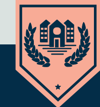
VETERANS HOUSING FUND