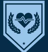
CAMPUS & WELLNESS FUND