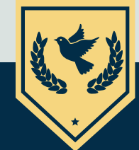
WADSWORTH CHAPEL & HISTORIC FUND