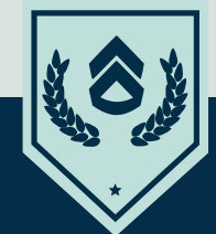
THE VETERANS FUND

On Memorial Day, we also proudly announced a historic lead gift from the Tunnel to Towers Foundation, ensuring the successful development of more than 500 housing units. Along with building homes for families, funds raised will also support career and mental health programs and re-envision the iconic Wadsworth Chapel as a cutting-edge center for moral injury. With the support of our community, we will restore the promise of this land for the Veterans and families who have given so much for our country.